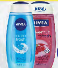
Nivea Shower Crème/ Gel Male & Female 500ml