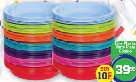
Elite Plastic Party Plate Combo