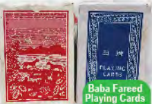
Baba Fareed Playing Cards