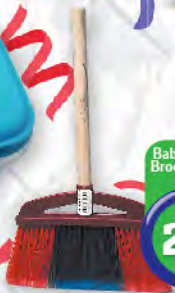
Baba Fareed Broom Smart