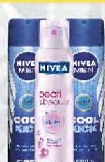
Nivea Aerosole Male & Female Assorted 150ml