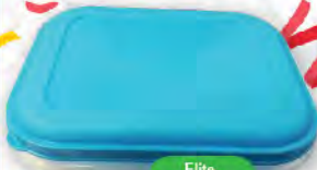
Elite Lunch Box