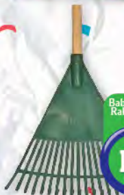
Baba Fareed Rake Green Leaf