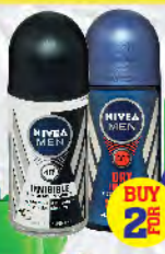
Nivea Roll On's Assorted Combo 50ml