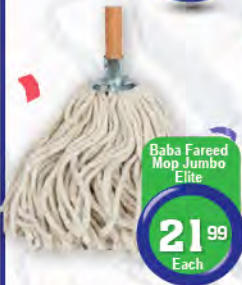
Baba Fareed Mop Jumbo Elite