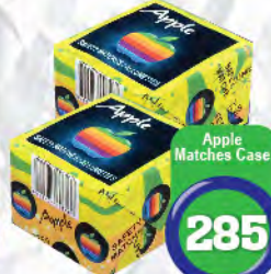
Apple Matches Case